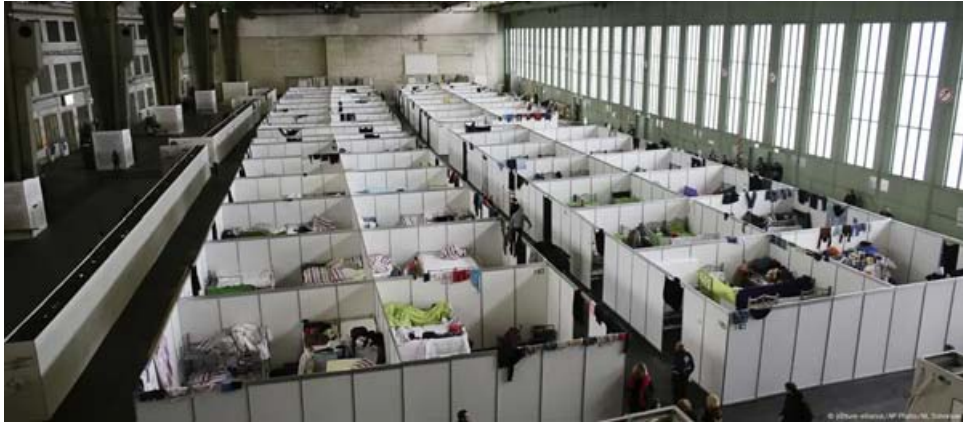
Picture: the refugee accommodation in the hangar of the airport Berlin Tempelhof, 2016