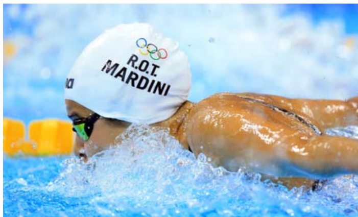
Picture: Yusra Mardini swimming for the Refugee Olympic Team (R.O.T.) at the Olympics in Rio de Janeiro, 2016 (source: The Guardian)

https://www.theguardian.com/world/2017/mar/17/yusra-mardini-syrian-refugee-and-olympic-swimmer-inspires-film#img-1