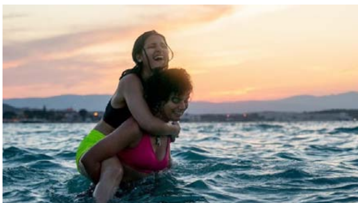
The Swimmers (2022), promotional picture for the movie https://www.imdb.com/title/tt8745676/mediaviewer/rm2381319425

The movie The Swimmers (USA & UK, 2022) tells the real story of the teenage sisters Yusra and Sarah Mardini who fled their home in Syria due to the war. Dive into their inspiring story with our in-depth look at the movie and our survey on it. Discover how this powerful film is changing perspectives on the refugee crisis and resonating with audiences worldwide.