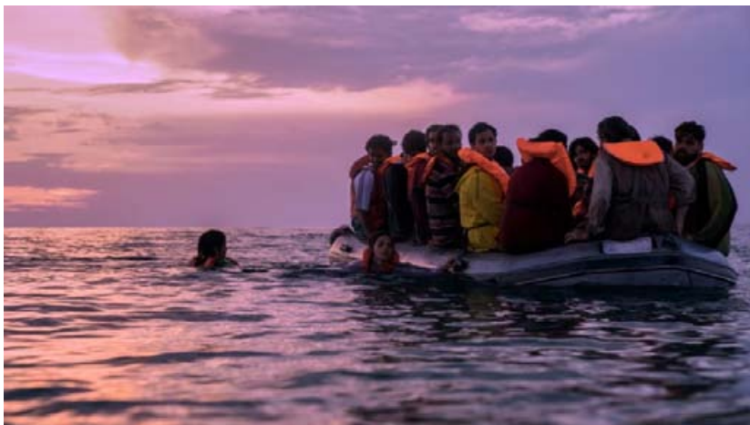
Picture: Yusra and Sarah swimming next to the sinking rubber dinghy, “The Swimmers”, 2022 https://readthespirit.com/visual-parables/wp-content/uploads/sites/21/2023/09/Dinghy.jpg

It’s not a big surprise that all of our respondents mentioned the ‘boat scene’; the moment when the big group of “desperate and scared” refugees sits together in a small dinghy and the situation gets more and more dangerous from one moment to another. Many respondents were particularly scared by the huge level of uncertainty that the flight over the sea brings. The worries don’t end with the uncertainty though; the difficulties and unexpected, fatal happenings, such as “when the engine went out” caused many of the passengers to lose hope in the movie as well.