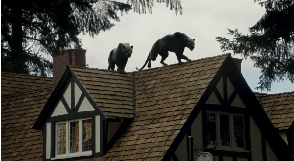
Illustration 2: The low-budget digital effects highlight their constructedness. Screenshot from the Zoo episode “Jamie’s Got a Gun” (season 2, episode 7) © CBS Television, 2016.

This illusion of control is reflected in the visual aesthetics of Zoo . The show excessively employs C-grade digital visual effects to depict many of the animals featured in the diegetic world (Illustration 2). These visual effects ensure that the animals seen on the screen are “no longer limited by the real animal,” since digital technologies “allow us to scan and refigure the real animal to make it exactly what we please” (Fudge 2002, 88). In this way, the digital visual effects create the illusion of controlling the animals.