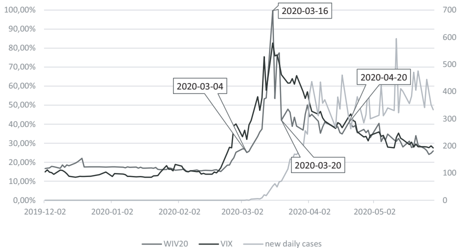
Figure 1. WIV20 and VIX indexes (a proxy of fear) and new daily cases of COVID-19 infection in Poland

Figure 1 presents the WIV20 and VIX indexes and new daily cases of COVID-19 infection in Poland during the period analyzed. This shows the relation between epidemic growth in Poland and increasing fear in the local and global context.