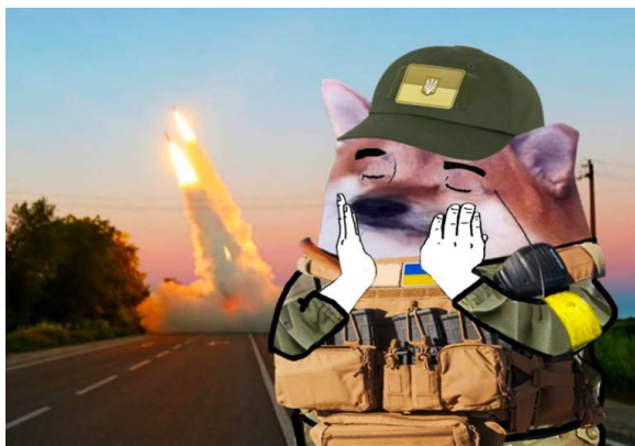
Figure 1: The picture presents the so-called NAFO ‘fella’ 1

Pro-Ukrainian memes against the 2022 Russian invasion play a number of significant roles. Apart from being comforting and relieving, they are informative as they help disseminate the current state of affairs in Ukraine and stand up to Russian propaganda. Memes become vessels of information or commentary on current events even on the official Twitter account of Ukraine ( https://twitter.com/Ukraine ). There are a number of pro-Ukrainian social media movements such as Saint Javelin, NAFO (North Atlantic Fellas Organisation) or Ukrainian Memes Forces that fight Russian disinformation in the form of memes and work as fundraisers for Ukraine. It is characteristic of NAFO that it bases memes on the image of the Shiba Inu dog, known on the internet as Doge (Figure 1). Their presence and activity have been recognised by Ukrainian government officials, i.e. Ukraine’s Minister of Defence, Oleksii Reznikov, who changed his profile picture to a NAFO meme (Hamill-Steward, 2022).