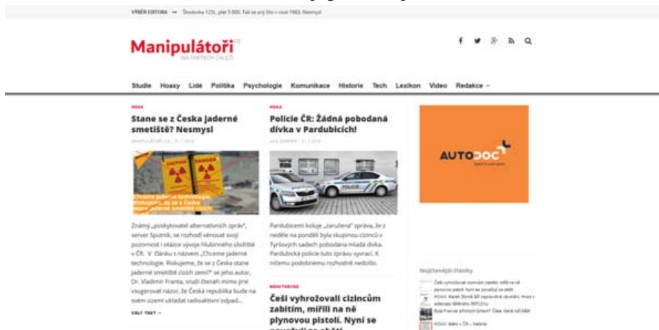
Photo 2. Home page of manipulatori.cz