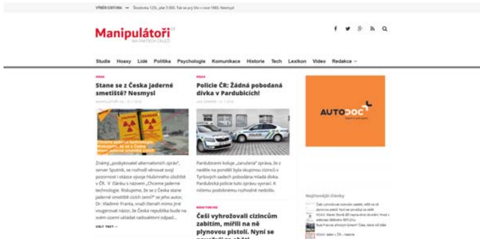
Photo 2. Home page of manipulatori.cz