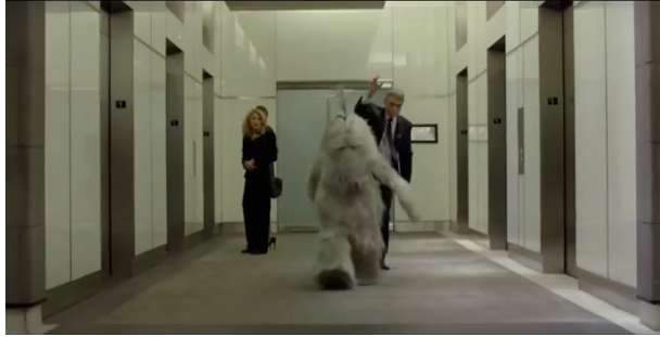
Figure 7: Personified IDEA is chased away. Screenshot from General Electric commercial (2014).