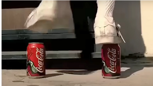
Figure 3: Pepsi commercial: COCA COLA CANS ARE STEPPING STONES (TO REACH FOR PEPSI). Screenshot from (banned) commercial (2017).