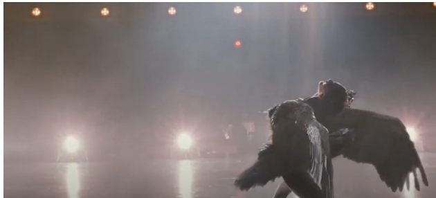
Figure 1b: ... metaphorically transforms into a swan. (Screenshots from Black Swan (Aronofsky, 2010))

Fig. 1 shows a hybrid metaphor in Black Swan , analysed by Estelle Bolon. Dancing “Odile” in Tchaikovsky’s Swan Lake , we see the ambitious dancer Nina Sayers ready to go onstage, with spread arms (Fig. 1a); when performing, she grows wings: BALLERINA IS BLACK SWAN (Fig. 1b). Nina so completely impersonates her role that she imagines herself to be a swan, naturalness and elegance presumably being among the features to be mapped.