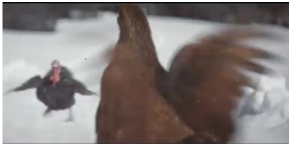
Figure 12: CHICKEN IS WINNING COWBOY IN A SHOOTOUT WITH A TURKEY. Screenshot from KFC (Christmas) commercial (2018).