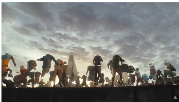
Figure 13: PEOPLE WEARING CLOTHES MADE OF ANYTHING EXCEPT WOOL ARE ZOMBIES. Screenshot from Woolmark commercial (2024).