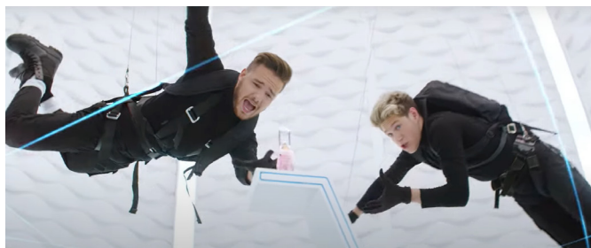
Figure 2: Members of the band One Direction steal a perfume bottle: YOU-AND-I PERFUME BOTTLE IS JEWEL. Screenshot from commercial (2014).

This subtype can be described as follows: of two phenomena that can be construed as a metaphorical target and source domain, respectively, one domain is depicted, while the other domain is suggested by the visual context in which this phenomenon appears. I also consider this variety to be at stake when a living creature (usually a human being) adopts a posture, makes a gesture or movement, and/or adopts a facial expression that clearly evokes another phenomenon (possibly aided by film techniques such as framing, lighting, and all the visual elements within a shot or scene [“mise-en-scène”]) – that “other phenomenon” then functioning as the metaphor’s source domain.