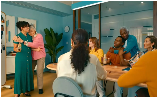
Figure 8: DRINKING A FRAPPUCCINO IS RECEIVING A GRANDPARENT'S HUG. Screenshot from Starbucks commercial (2024).

problem verbally straightaway. However, the commercial visualizes this insight as IDEA IS AN UNATTRACTIVE CREATURE – a multimodal metaphor of the verbo-pictorial variety. The events in the mini-story – supported by mood-music – show the unfriendly treatment of a personified IDEA (being jeered at, chased away [Fig. 7], avoided, ...). Jasim rightly emphasizes, however, that the fluffiness of the creature also makes it cute, reinforcing the commercial's message that innovations that initially may seem scary can eventually be attractive, loved, and wanted.