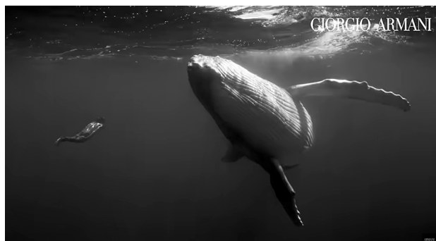
Figure 10: MAN IS WHALE. Screenshot from commercial Acqua di Giò aftershave (2024).

In one long, wordless scene in the iconic anime Ghost in the Shell a female cyborg, Kusanagi, is seen wandering around in, and absorbing the atmosphere of, a metropolitan city. Maintaining that “identity and how it is influenced by the modern technological world is at the heart of this movie”, Babette Libbenga proposes the metaphor IDENTITY IS CITY ( Ghost in the Shell – Ghost City , Fig.11), with the city’s artificiality and its claustrophobic and disorienting impact as pertinent mappings. During the scene, moreover, the same song is heard that was also audible in the opening sequence of the film when Kusanagi was created/assembled, further reinforcing the “identity” theme – thus making the metaphor arguably multimodal. Margherita Zocca argues along similar lines. Discussing the urban landscape in La Notte (Antonioni, 1961), she points out that “Milan, with its towering skyscrapers, impersonal industrial zones and vast urban spaces, is not just a backdrop but a representation of the emotional and spiritual emptiness that permeates the lives of the protagonists”, enabling the construal of the metaphor PROTAGONISTS’ ALIENATION IS CITY.