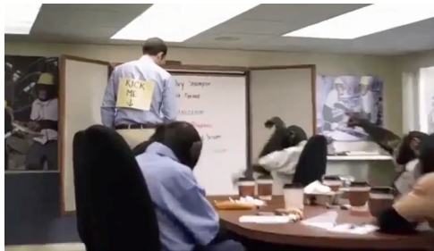
Figure 4: UNPROFESSIONAL OFFICE CO-WORKERS ARE UNRULY CHIMPANZEES. Screenshot from CareerBuilder commercial campaign (2005 or 2006).