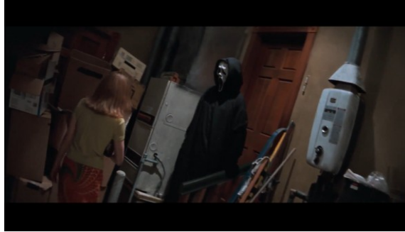
Figure 9a: Dutch/canted angle of Tatum meeting the villain, Mr Ghostface.

metaphor combines elements of the contextual metaphor and the pictorial simile variety, but is thus also multimodal.