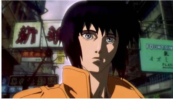
Figure 11: (KUSANAGI'S) IDENTITY IS CITY. Screenshot from Ghost in the Shell (Oshii, 1995).