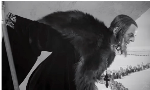
Figure 5: IVAN IS AN EAGLE. Screenshot from Ivan the Terrible, Part I (Eisenstein, 1945).

A straightforward example of a contextual metaphor is ONE DIRECTION'S YOU & I FRAGRANCE BOTTLE IS A PRICELESS/GUARDED JEWEL , in a commercial featuring the band itself (One Direction – You & I Fragrance (Commercial), analysed by Eveline Stommels (Fig. 2). Another example is Pepsi Cola's naughty depreciation of its main competitor by showing a small boy using Coca Cola cans as stepping stones to reach up to the top button in a vending machine dispensing Pepsi cans