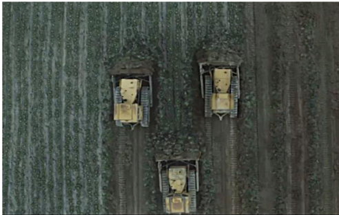
Figure 4: Ripping up the Fields

The radiation is perceived as the infection affecting humans. This verbal mode is supported by a visual one in Episode 4 “The Happiness of All Mankind”. The scene opens with the picture of bulldozers ripping off the upper layer of the cabbage field like medical instruments removing an infected skin (Figure 4). The men spraying the road in protective suits with hoods drawn tight and gas masks resemble medieval plague doctors (Figure 5).