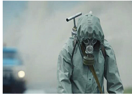
Figure 5: ‘Doctors’ Disinfecting the Streets