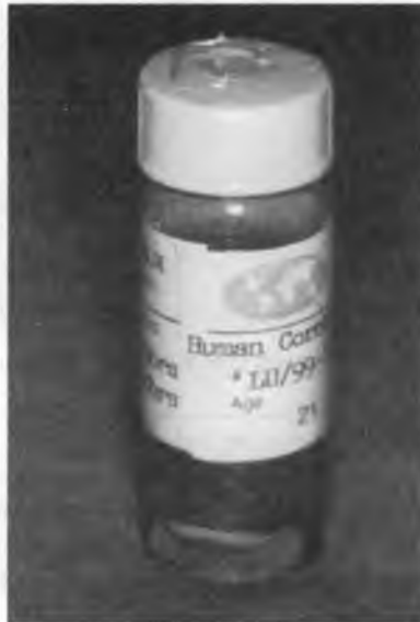
Fig. 1. Corneo-scleral button in Eusol preservative medium

Just before ocular tissue procurement, corneas are evaluated by a penlight in order to identify macroscopically ocular diseases, infections, or pathological large corneal blood vessels. Recovered corneo-scleral buttons (scleral rim measures about 3–4 mm of width) are placed in a storage medium – Eusol in the temperature of +4°C for maximum 14 days (Fig. 1). Whole eyeballs are placed in moist chambers and in 24 hours sclera and cornea are retrieved and processed. Sclera is stored in 100% ethanol in the room temperature and expires after one year.