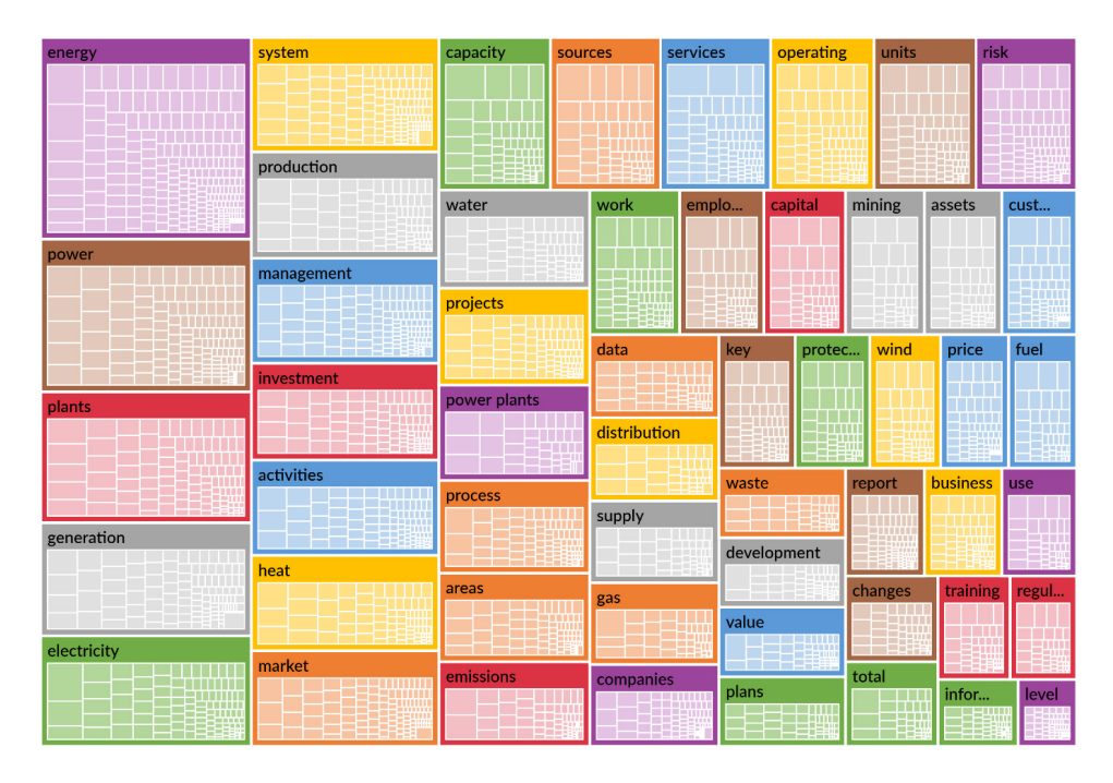
Figure 1. Hierarchy Chart – compared according to the amount of coding references (reports: ENA, PGE, TPE, ZEP)