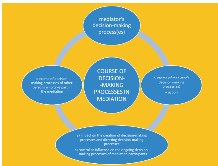
Figure 1. Course of decision-making processes in mediation

all mediation participants. The decision-making participation will consist of a real collective effect on the outcome of decisions made during mediation. Any decision, except for the first one which initiates the mediation process, will be a consequence of previous decisions (see Figure 1). I accept that competent to make decisions in mediation are ‘actors’, i.e. the mediators, parties, attorneys, and other persons involved in mediation (e.g. experts). 43 The mediator plays an essential role in the process, enabling mutual communication 44 and organising the resulting information system. This perception of decision-making processes in mediation entails that we focus on the actual course of decision-making and not on the formal powers to make a decision. At the same time, the course of decision-making processes takes into account the interaction of decision-making processes and actions of all people involved in mediation, taking into account the strong interconnection. 45