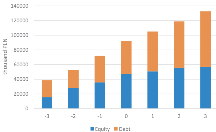
Figure 1. The size of equity and debt in years -3 to +3