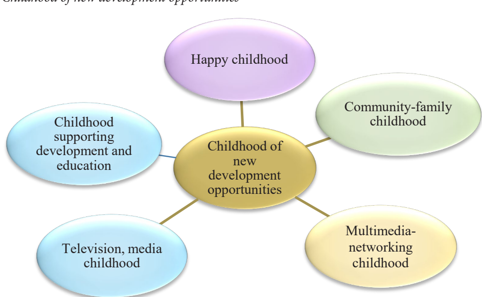
Figure 1. Childhood of new development opportunities

Characterizing the different faces and dimensions of childhood, Izdebska (2015) points to: childhood of new developmental opportunities and childhood at risk. The childhood of new development opportunities has different dimensions, shown in Figure 1.