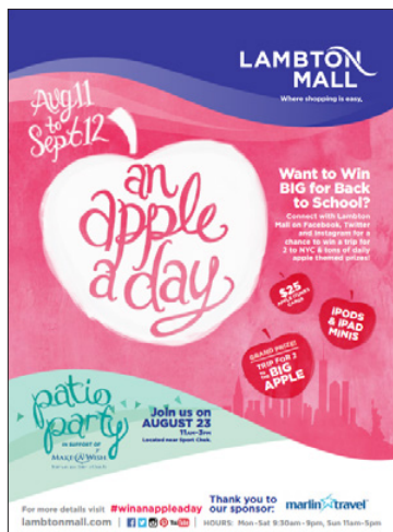
Figure 1a. Advertisement of the Lambton Mall ( http://click-sarnia.com/apple-day-lambton-mall-contest/ , retrieved 20 February 2016)

Moreover, modern advertising business relies heavily on the persuasive power of proverbs, frequently building its eye-catching slogans upon their structure. As an illustration, consider the advertisement by the Lambton Shopping Mall (Figure 1a).