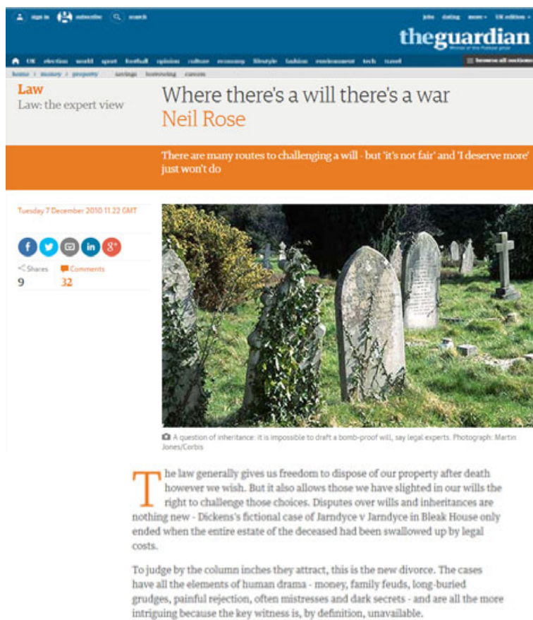
Figure 3. Fragment of the article “Where there’s a will there’s a war” from The Guardian ’s official website (available at http://www.theguardian.com/law/2010/dec/07/neil-rose-will-disputes ; retrieved March 23, 2015).