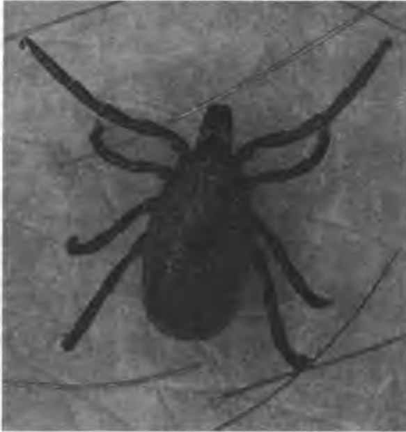
Fig. 2. A magnified image of a tick

The disease typically takes a biphasic course. After an incubation period, the first phase of TBE takes the form of an influenza-like infection (fever, headache, malaise, myalgia, sometimes abdominal pain). The second phase usually begins suddenly, after a few days' of asymptomatic period, with meningoencephalitis . At this stage often appear neurological symptoms and non-specific psychiatric disorders. They may assume a variety of forms (1, 2, 13). Many authors notice that most frequent psychiatric disorder in TBE – especially in the severe course – is impairment of consciousness or delusional and catatonic disorders. Other symptoms, like: cognitive dysfunctions, memory and attention disorders, depressive symptoms are common in the mild course of TBE. Cognitive dysfunctions as well as depressive symptoms may be present even after acute phase of TBE. Those symptoms impair patients' functioning and decrease their quality of life. Patients in acute phase of TBE are seldom examined and treated by psychiatrists (6, 10, 11).