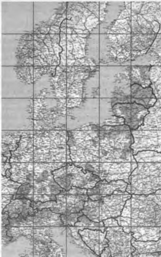
Fig. 1. Endemic areas of TBE in Europe.

Tick-borne encephalitis (TBE) is a neuroinfectious disease caused by TBE virus (TBEV). There are two subtypes of the virus: eastern and western. The latter is transmitted through bites by Ixodes ricinus and appears endemic in the large parts of Northern, Central and Eastern Europe (e.g. Baltic Sea area, Germany, Switzerland, Austria, Poland, Slovakia, Czech Republic, Hungary and countries of former Yugoslavia (Fig. 1). The European type of TBE is also known as Central European Encephalitis (CEE) (3, 4, 7, 8, 12). In recent years a sharp increase of TBE cases in Poland was noted. North-east of the country is an endemic area of the disease. This is a region of many forests with considerable numbers of ticks (6).