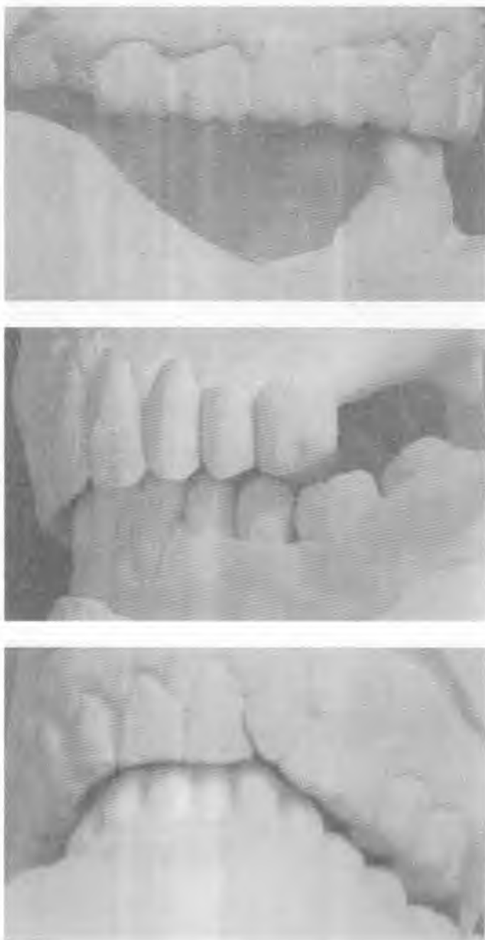
Fig. 4. Therapeutic position of lower jaw