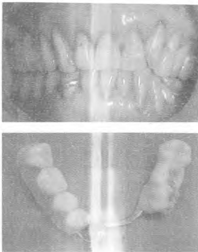
Fig. 7. Removable partial overdenture (d. 34–37)

using splint it was proved that mandibula was in stable position according to maxilla, that is why the final prosthetic restoration was made. In fixed therapeutic position of lower jaw occlusion plane was compensated by grinding of overhanging cuspids of tooth crown 25,26 and making removable partial overdentures of teeth 34,35,36,37 with acrylic surface. that is why probable occlusion correction was possible (Fig.7). Pathologous attrition of teeth 32,33,34 was corrected using composite material.