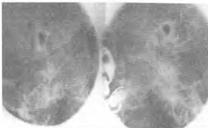
Fig. 6. TMJ X-ray take in therapeutic position