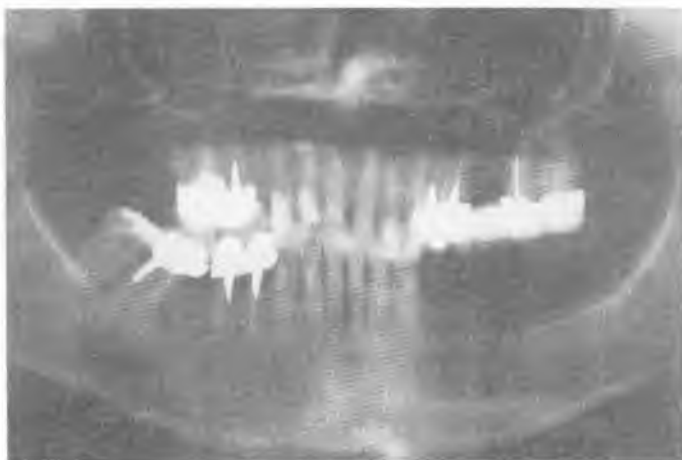
Fig.1. Panoramic radiographs made during the first visit

A female patient, age 71, came to The Department of Prosthetic Dentistry University School of Medicine in Lublin because of constant pain of the face which was radiating in the direction of temple and neck. Strength of the pain was defined as 6–7 in ten degrees of VAS scale. In history the connection between pain manifestation and making prosthetic restoration about four years ago was ascertained. The patient described her psychonervous condition