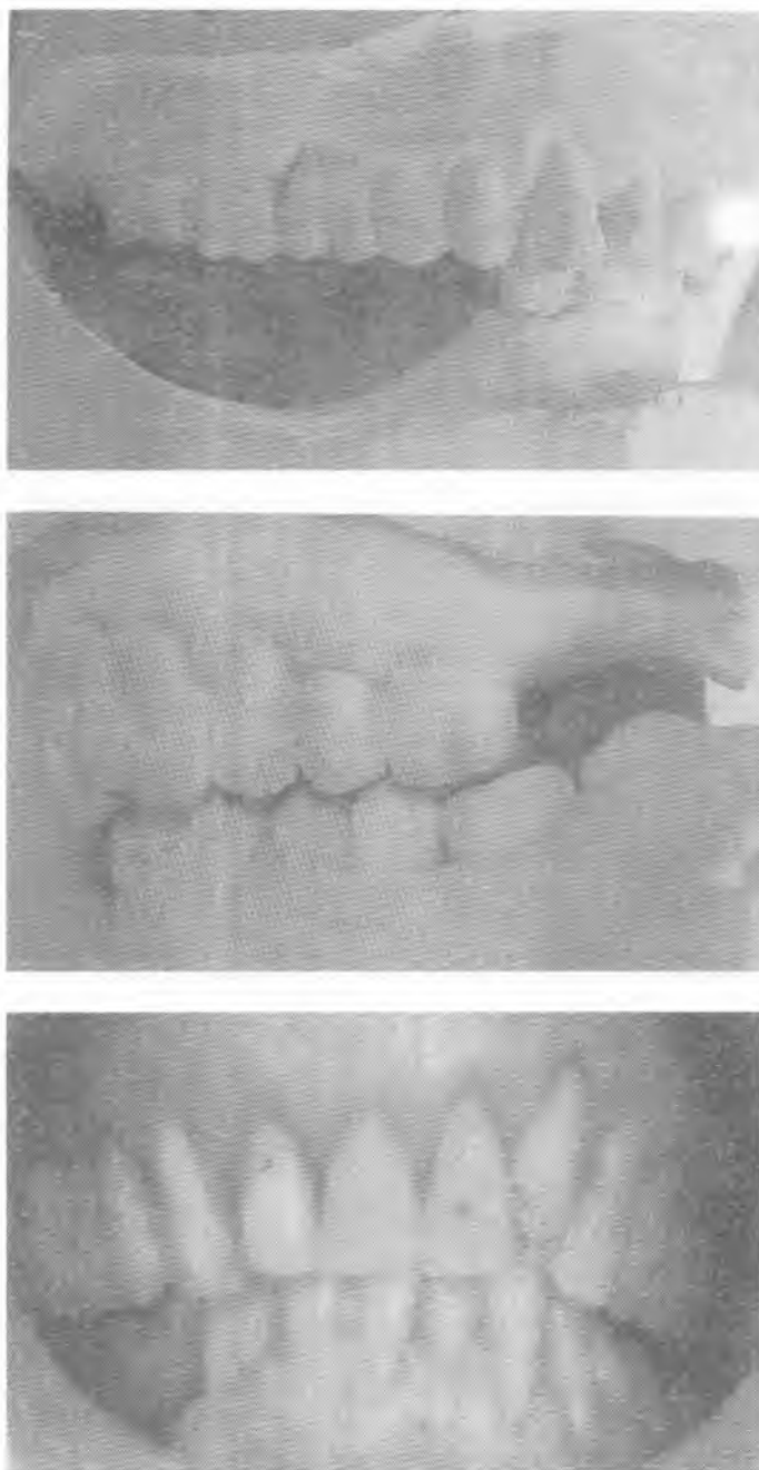
Fig. 3. Maximal intercuspitation before treatment (diminished height of occlusion)