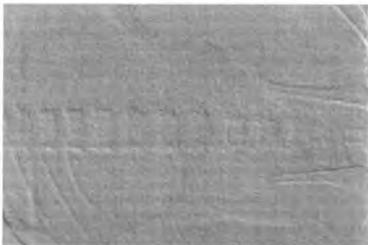
Fig. 2B. The same image reformatted using 3D Emboss function and positive mode allows better visualization of bone edges of lumbar vertebra