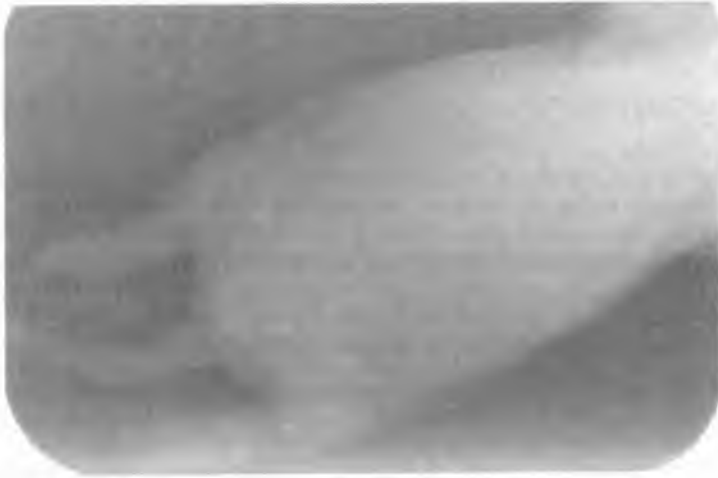
Fig. 1A. Native digital radiogram of a 1-day old rat pup

Digital radiography software proved useful in optimization of viewing conditions that in turn reflected quality and reproducibility of linear and density measurements. Correct linear and density measurements were possible only after calibration of each image using Image Resolution Calibration method. Afterwards, every radiogram was magnified; two-fold magnification factor was used (Figs. 1. A, B). Larger magnification resulted in visualisation of