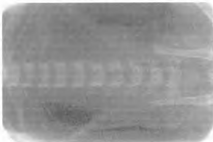
Fig. 2A. Native digital radiogram of lumbar spine of a 22-day-old rat pup

and automatic Enhancement option proved inappropriate in this study for evaluation of rat pups bone ossification. In some cases manual adjustment of contrast and brightness was applied simultaneously with the positive mode which was advantageous in younger and smaller pups (Fig. 1 B). In contrast, 3D Emboss function was more suitable for visualization of bone edges in older animals with a more advanced process of ossification (Fig. 2.A, B). It was also used in combination with positive image reformatting. Activation of single colour highlight of pixels characterized by the same density (tomosynthesis) helped in precise determination of bone margins during linear and density measurements. Full colour option proved advantageous neither in carrying out of linear nor density measurements.