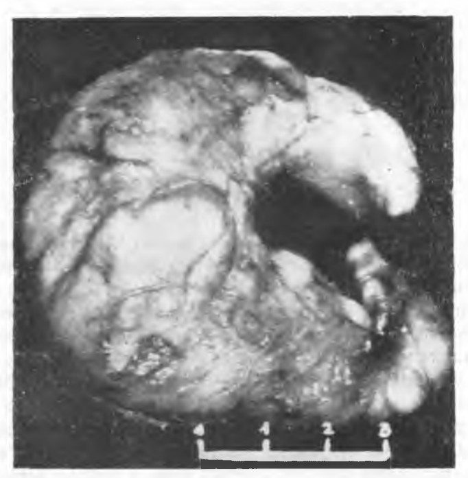
Fig. 1. U-shaped tumour surrounding the oesophagus

Radiological examination of the oesophagus revealed a circular funneling defect, immediately above the diaphragm which corresponded to a dilatation of the oesophagus at this site. Barium swallow X-Rays gave pictures similar to those in cardiospasm and a barium reached the stomach through a very narrow oesophageal lumen. A clinical diagnosis of cardiospasm was suspected.