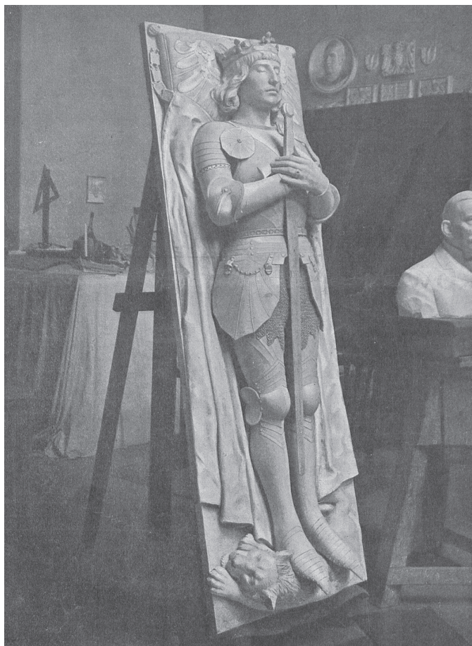
Fig. 4. Władysław Warneńczyk's tomb plaque