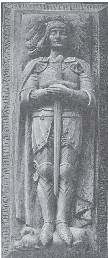
Fig. 2. Sketch of Warneńczyk's figure