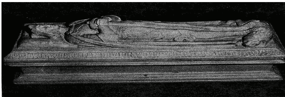
Fig. 1. The original model of Warneńczyk's sarcophagus

Source: A. Sołtys, Pomniki Antoniego Madeyskiego na tle problemu restauracji katedry krakowskiej , "Studia Waweliana" 1994, vol. 3, p. 165.