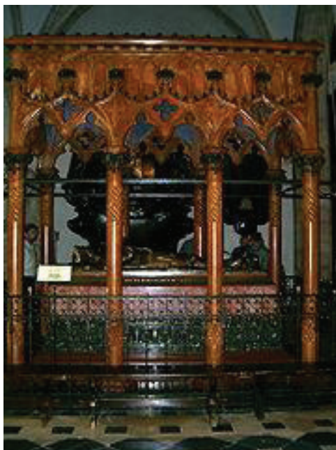
Fig. 7. Tomb of Władysław Warneńczyk

[...] yesterday in the afternoon, quietly and with no celebrations, the tomb of King Władysław Warneńczyk, sculpted by an artist-sculptor Antoni Madeyski, was unveiled in the Wawel Hill. Today very many people, both local and travelers, hurried to the Cathedral in order to see the monument. The tomb was unveiled in the best time, when Cracow is visited by the largest number of people from all parts of Poland so they will have the opportunity to see the latest ornament of the Cathedral 53 .