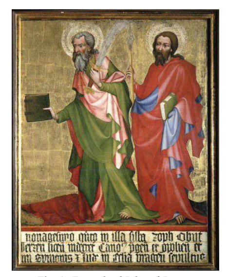
Fig. 1. Epitaph of John of Jeřeně (NG, Prague, ID O 1268), 1395