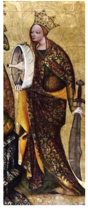
Fig. 4. St. Catherine of Graudenz Altar (around 1400)