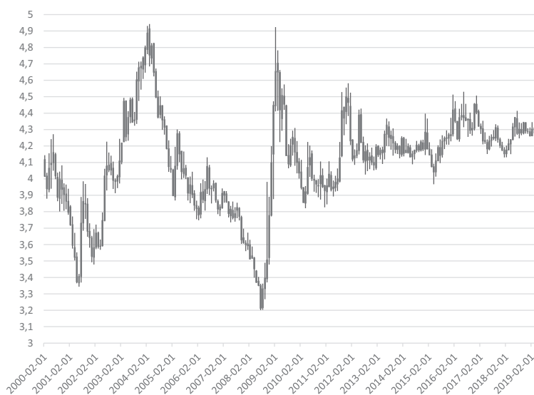
Figure 2. EUR/PLN spot rate, 1-month candlestick (February 2000 – March 2019)