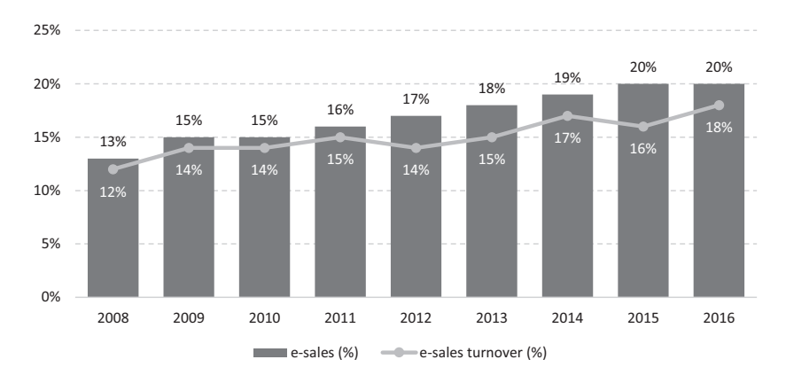
Figure 3. E-sales and e-sales turnover in the EU-28 in the period 2008–2016 (% of enterprises, % of total turnover).

outlets (Skowronek, 2011). The effect of a higher shopping activity among Internet users is the simultaneous growth in electronic sales, as presented in Figure 3.