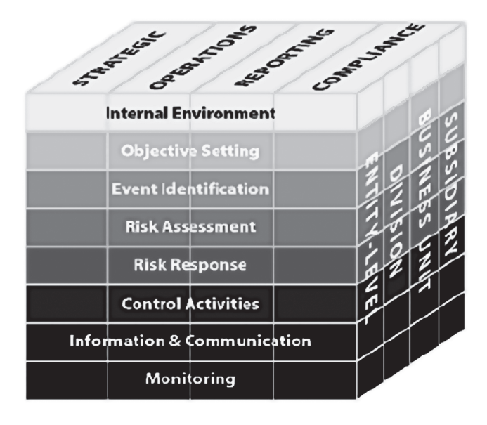
Figure 3. The COSO framework

The introduction of principles is inseparable from internal control. It is facilitated by the Integrated Framework – COSO I (Figure 3). This determines the components, principles and factors required by organizations in order to manage risk effectively by implementing a system of internal control. Duties and responsibilities must be clearly defined so that each employee group understands its role in addressing the risk, control and affairs it is responsible for, as well as the principles and means of cooperation with other groups. There ought to be no gaps and unnecessary or accidental overlap of effort in addressing risk and control (Anderson & Eubanks, 2015, p. 1). The COSO aims to ensure leadership in three interrelated fields: Enterprise Risk Management (ERM), internal control and prevention of abuse.