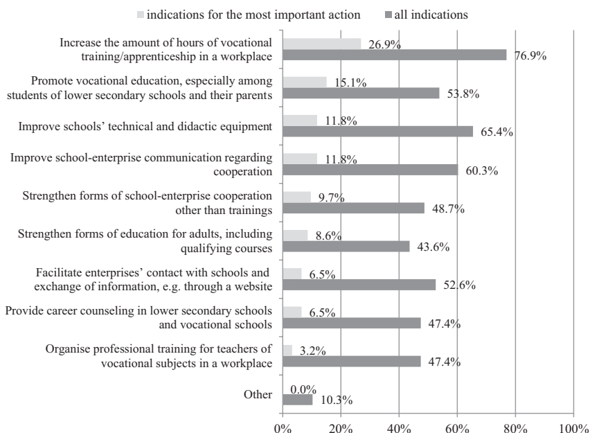
Figure 1. Important actions to be taken in order to strengthen vocational education and to adjust it to the requirements of labor market (expressed in %)

In one of the questions, the employers were asked to indicate and sort by priority up to 5 actions which, in their opinion, should be taken to strengthen vocational training and to adjust it to the requirements of labor market. Figure 1 presents the total number of indications and the percentage of indications of actions considered the most significant. Most respondents indicated the need to increase the amount