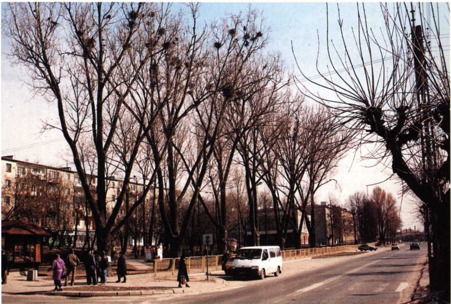
Fig. 7. Mistletoe ( Viscum album subsp. album ) in the crowns of Populus x euramericana . Kraśnik, station no. 53