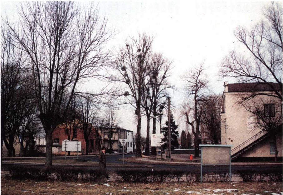
Fig. 4. Mistletoe ( Viscum album subsp. album ) in the crowns of Populus x trichocarpa . Kraśnik, station no. 40