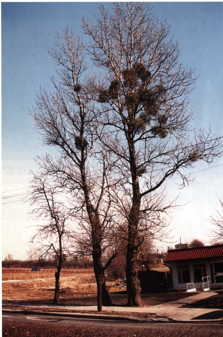
Fig. 5. Mistletoe ( Viscum album subsp. album ) in the crowns of Populus x berlinensis . Kraśnik, station no. 44