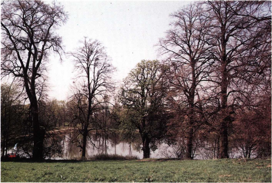
Fig. 3. Mistletoe ( Viscum album subsp. album ) in the crowns of old specimens of Tilia cordata . Stróża Druga, station no. 7