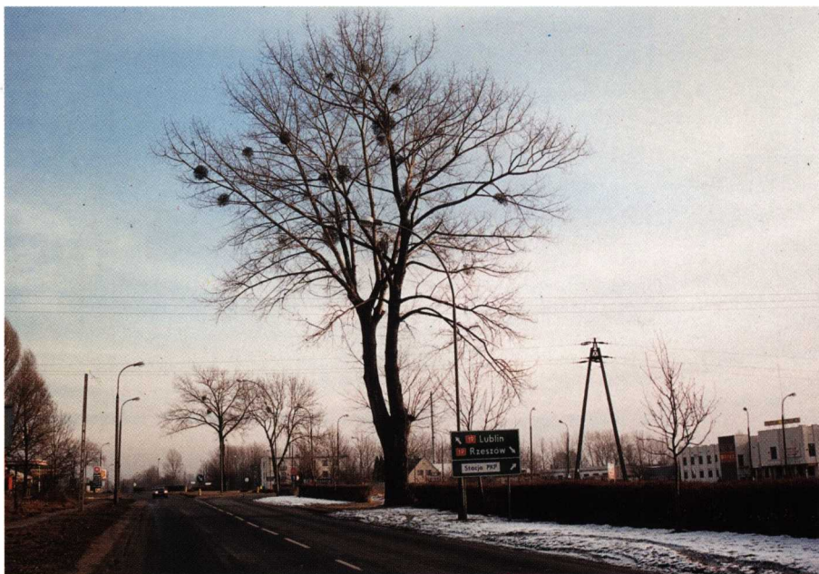
Fig. 8. Mistletoe ( Viscum album subsp. album ) in the crowns of Populus x euramericana . Kraśnik, station no. 59