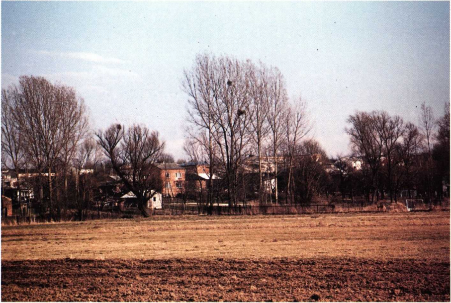
Fig. 6. Mistletoe ( Viscum album subsp. album ) in the crowns of Populus x euramericana . Kraśnik, station no. 49