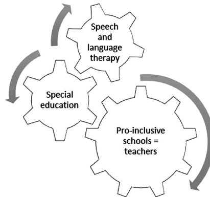
Figure 1. Model of collaboration approach to intervention in pupils and students with communication disabilities

results from the fact that teachers and speech therapists express desire to intensify their practical training as well as to increase their knowledge and collaborative practice; but, at the same time, they also express frustration with the current system of inequality concerning funds, personal commitment and others 14 .