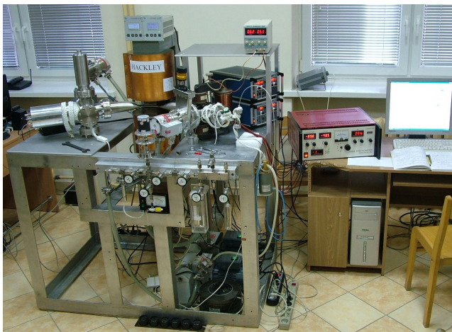
Figure 1: Overall view on the 60^\circ magnetic sector mass spectrometer. The inlet system is installed at the front of this picture. The ion source is on the right side and the collector assembly on the left. The mass spectra and isotope analyses are computer controlled.

In Fig. 2 is shown the triple collector assembly dedicated for simultaneous collection of the 3 isotopes in S^- spectrum. The same slit system can be used for positive ions of O_2^+ .